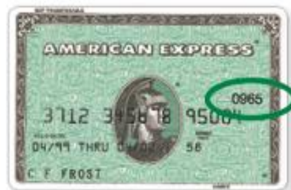
American Express CCV